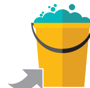
8 - 10 lt bucket