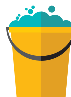
8 - 10 lt bucket